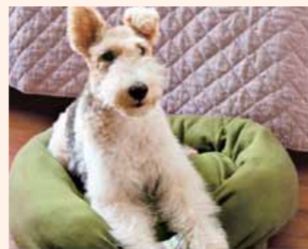
How To: SWEATSHIRT PET BED

Then finally, watch how your furry friend warms up on his/her new bed.